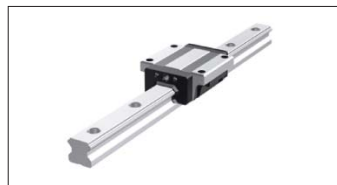
Linear Motion (LM) Guides

The Oil shock saw the demise of heavy industry, pushing the high-tech and light industries increasingly to the fore. Buoyed by depreciation in the value of the yen as well as the outstanding quality of products manufactured in Japan, export volumes to Europe and the United States climbed steadily. Under these circumstances, demand was high for the volume manufacture of quality products. With factory automation advancing across production frontlines, machine tool production volumes increased and the proportion of advanced numerical control (NC) machine tools saw steady growth. Against this backdrop, the application of LM guides enjoyed explosive growth.