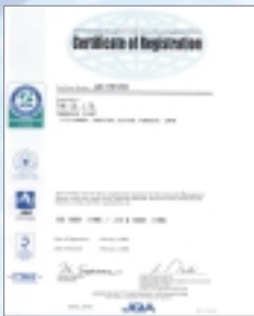
ISO 14001 Certificate

The THK Group regards care for the global environment as an important management issue. We fully recognize that our responsibility to society entails specific environmental protection actions. For this reason, we have set environmental targets, covering all aspects of our operations, enabling us to accurately grasp the impact our products and services have on the environment. We also have established Group-wide environmental standards to step up our compliance system and work for environmental management. We place ongoing emphasis on saving resources and recycling, with particular focus on cutting and