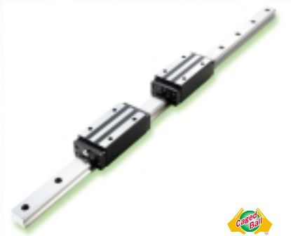
LM Guide with Caged Ball™ Technology

This environmental concept was symbolized in “LM Guide with Caged Ball™ Technology” commercialized in 1996. Our Caged Ball™ LM Guides feature low noise and low vibration and high resistance to ash and dust, which contribute to improve the work environment. Moreover, the high-speed performance requires no maintenance for long periods of time, and the materials used in the products and manufacturing process less damaging to the environment, which are highly esteemed by our users.