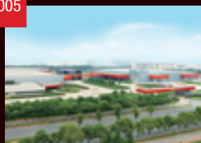
THK MANUFACTURING OF CHINA (WUXI) CO., LTD. (China) commenced operation THK (CHINA) CO., LTD. (China) established