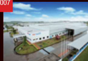
THK RHYTHM (THAILAND) CO., LTD. (Thailand) commenced operation