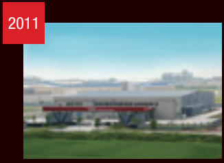
2011 THK MANUFACTURING OF VIETNAM CO., LTD. (Vietnam) commenced operation