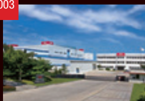
Second Plant of DALIAN THK CO., LTD. (China) commenced operation THK (SHANGHAI) CO., LTD. (China) established