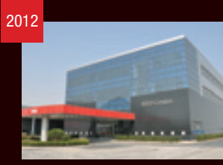
2012 R&D Center (China) commenced operation