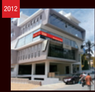
2012 THK India Private Limited (India) established