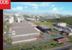
THK MANUFACTURING OF CHINA (LIAONING) CO., LTD. (China) commenced operation THK LM SYSTEM Pte. Ltd. (Singapore) established