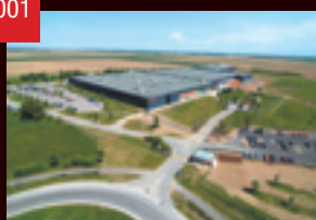
THK Manufacturing of Europe S.A.S. (France) commenced operation