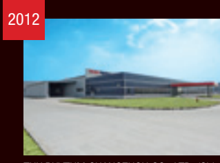
2012 THK RHYTHM CHANGZHOU CO., LTD. (China) commenced operation