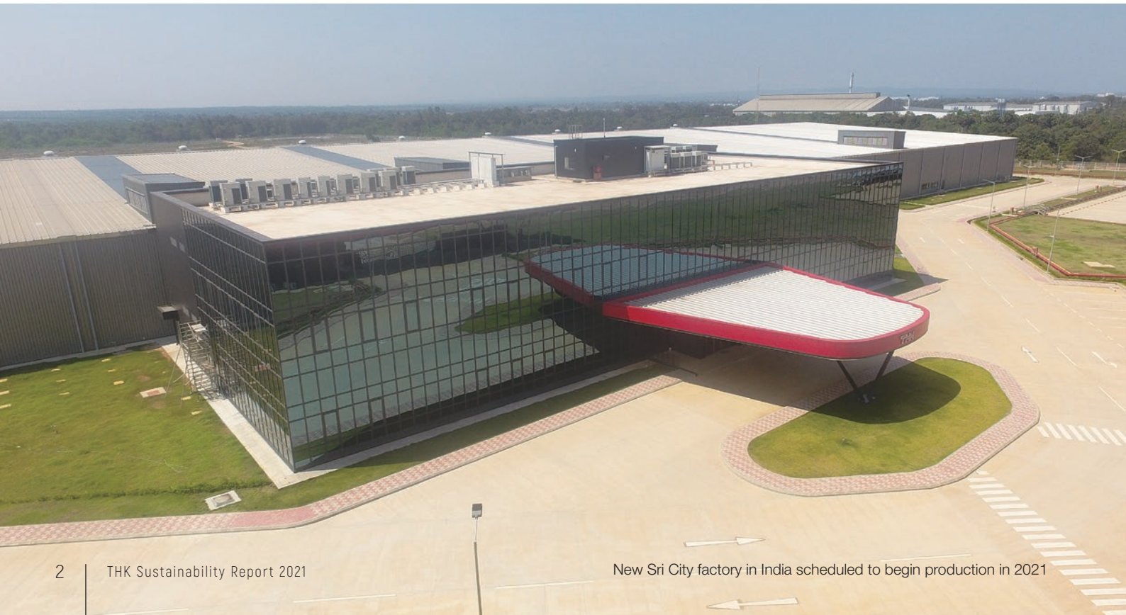
New Sri City factory in India scheduled to begin production in 2021