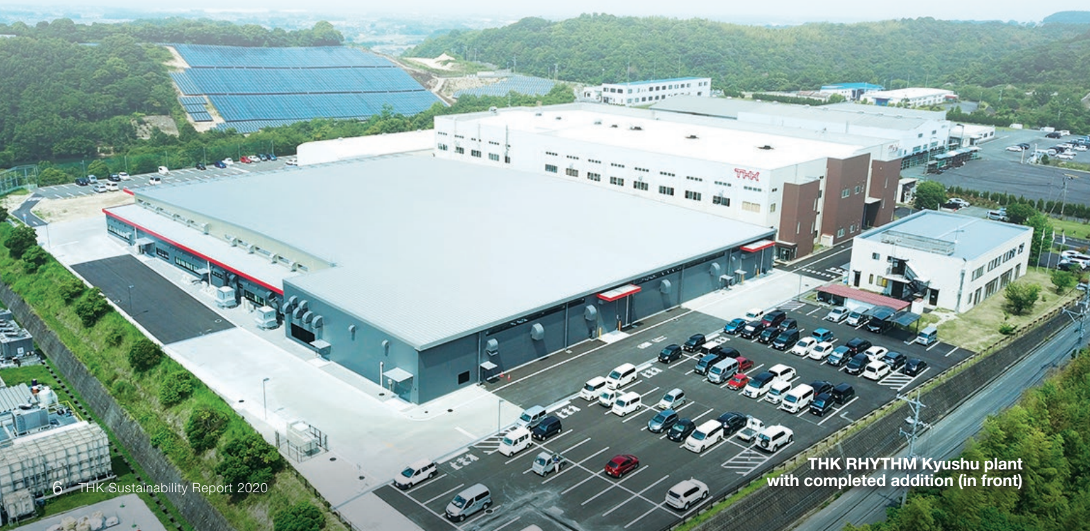
THK RHYTHM Kyushu plant with completed addition (in front)